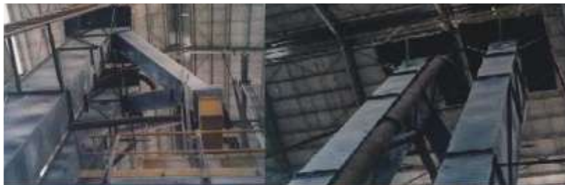
← Bucket Elevator