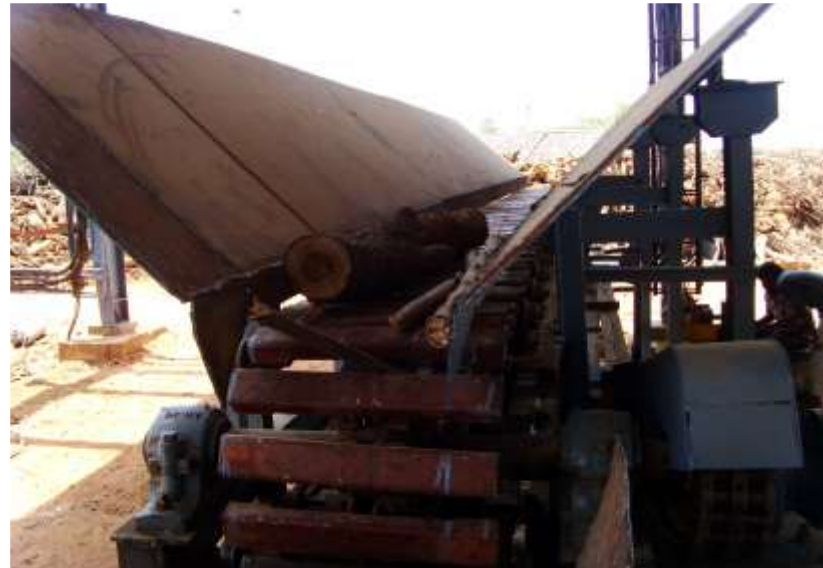
Wood Log Handling Systems ↑