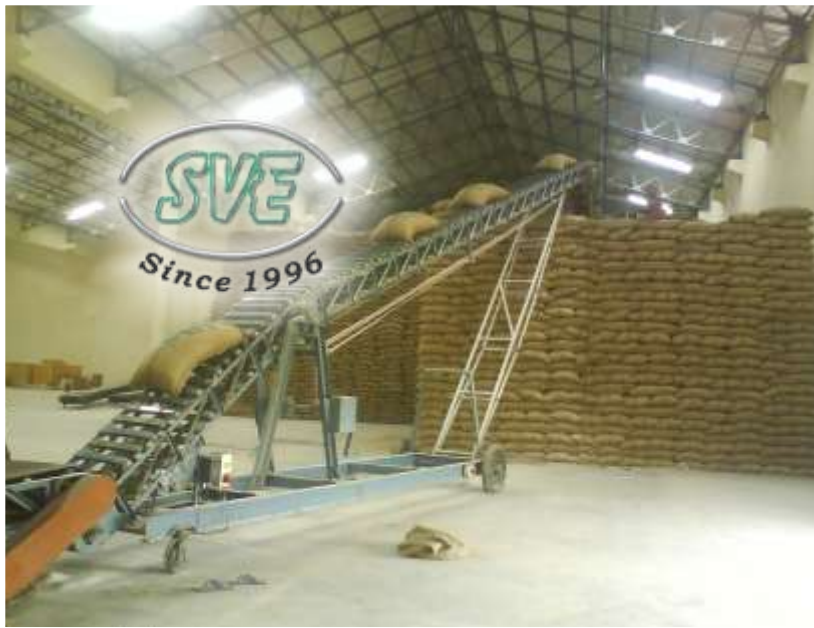
← Bag Handling Systems